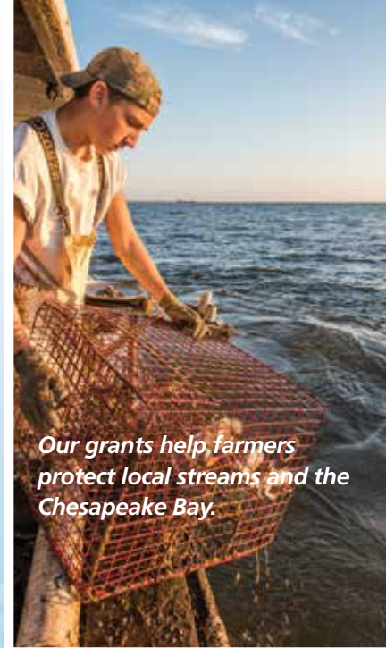
Our grants help farmers protect local streams and the Chesapeake Bay.

Our conservation grants are used to help farmers install conservation practices on their farms that meet Maryland's Chesapeake Bay restoration goals. In Fiscal Year 2023, Maryland farmers who received these grants invested $281,056 of their own money into projects that will prevent an estimated 2.9 million pounds of nitrogen, 37,261 pounds of phosphorus, and 20,695 tons of soil from entering Maryland waterways. The program is delivered by the state's 24 soil conservation districts with technical guidance from USDA's Natural Resources Conservation Service. The chart shows MDA grant-supported practices that help Maryland meet its nutrient and sediment reduction targets.